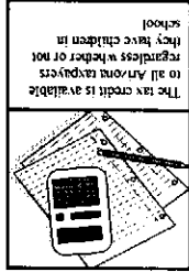
The tax credit is available to all Arizona taxpayers regardless of whether or not they have children in school.

The Arizona Legislature passed a law (A.R.S. 43-1089.01) allowing Arizona taxpayers to contribute up to $400 to a